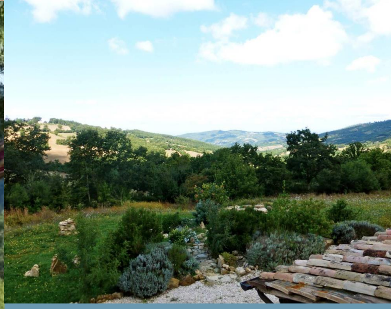
Podere Bellavista 2 Roccalbegna, Tuscany