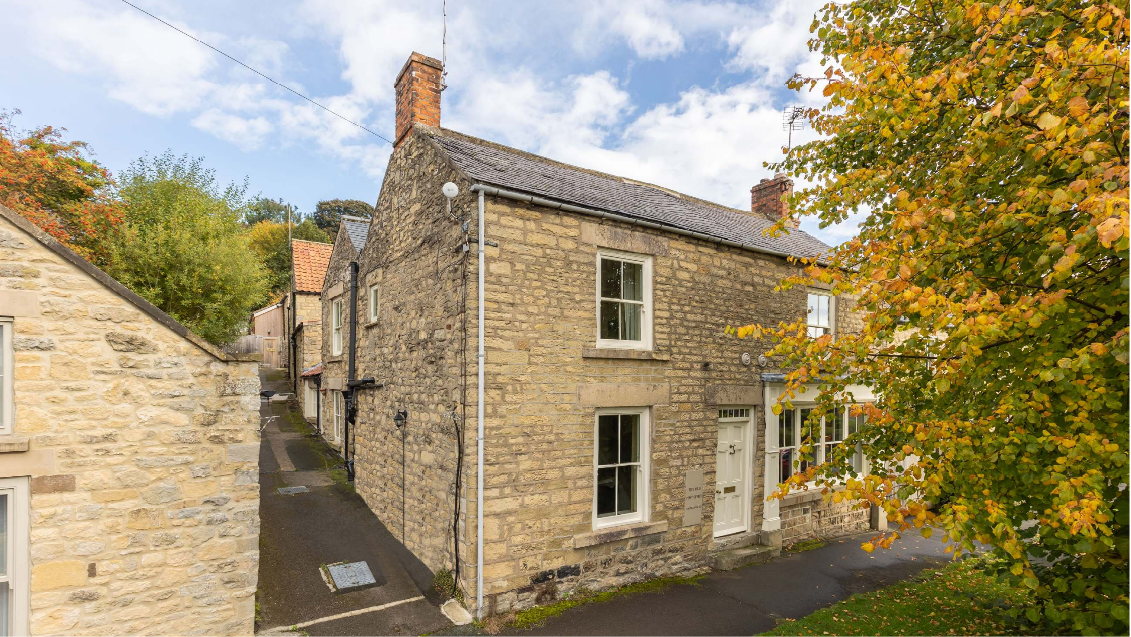
The Old Post Office West End, Ampleforth, North Yorkshire