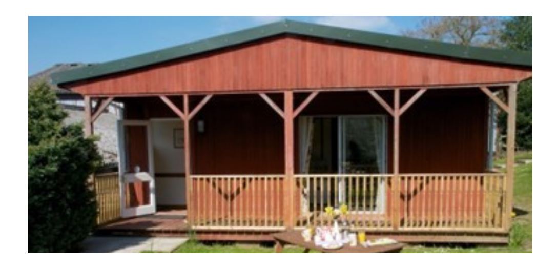
Carp Lodge is a spacious, two bedroom wooden lodge with a large kitchen and a large lounge/dining area. It sleeps 6 in a double room and room with 2 single beds and a set of bunk beds. It has night storage heating, a large covered veranda and lovely views over Home Lake and the woodland. Carp Lodge has in the past been used as an activity centre and offers an excellent space for group workshops.