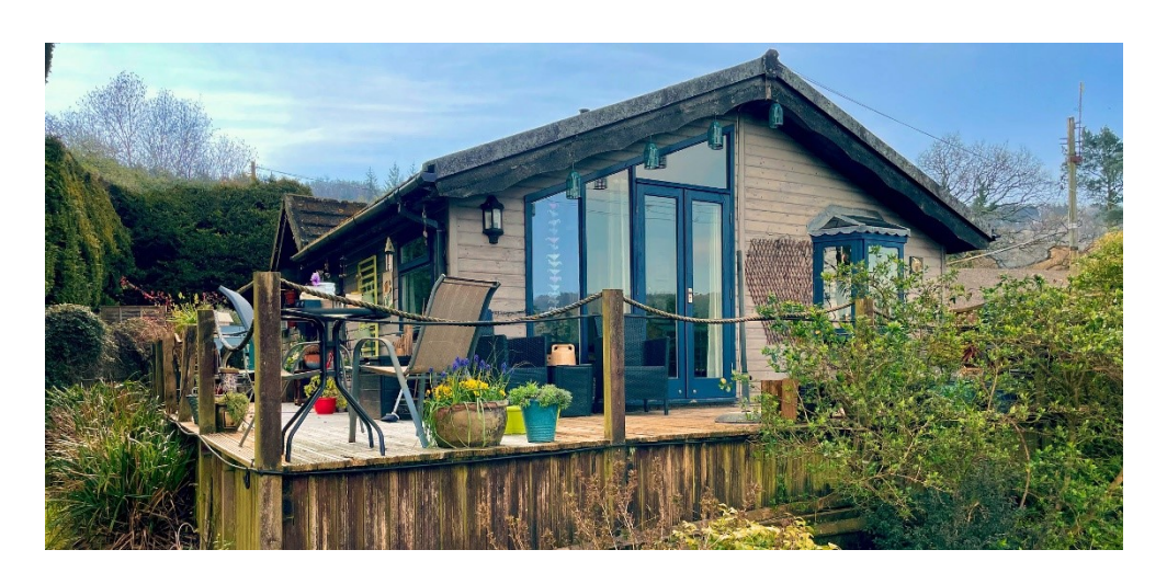
Perch Lodge (current Managers Accommodation) provides a comfortable 2/3 bedroom self-contained chalet. It has a large open plan sitting/dining/kitchen area, its own private garden and takes advantage of the glorious outlook.