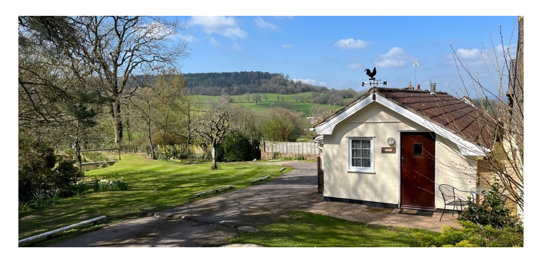
Lake Cottage is a small, charming cottage with lake views. Ideal for fishermen being only 30 meters from Home Lake, the cottage has an entrance with steps down into a fitted open plan kitchen and dining/living room with wood burner. There is a main bedroom and a further bedroom and bathroom which is accessed from a door off the main bedroom