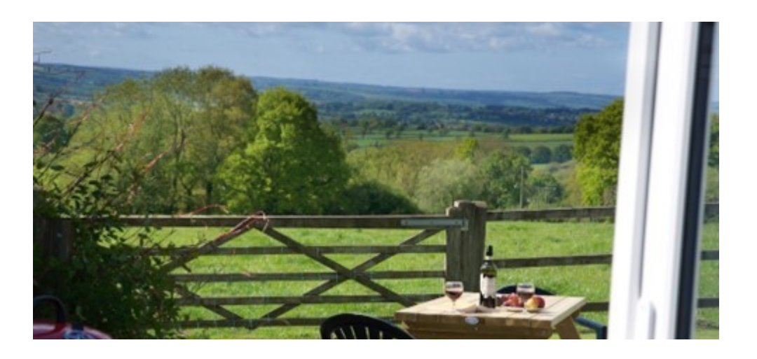
Stable Cottage is a three-bedroom single storey cottage with its own garden with superb views over farmland and distant woods. The lounge/diner with wood burner and large glass conservatory makes this a lovely roomy cottage with lots of space for the family. There is a separate kitchen. The double bedroom is off the living room and there are 2 further twin bedrooms and a large bathroom.