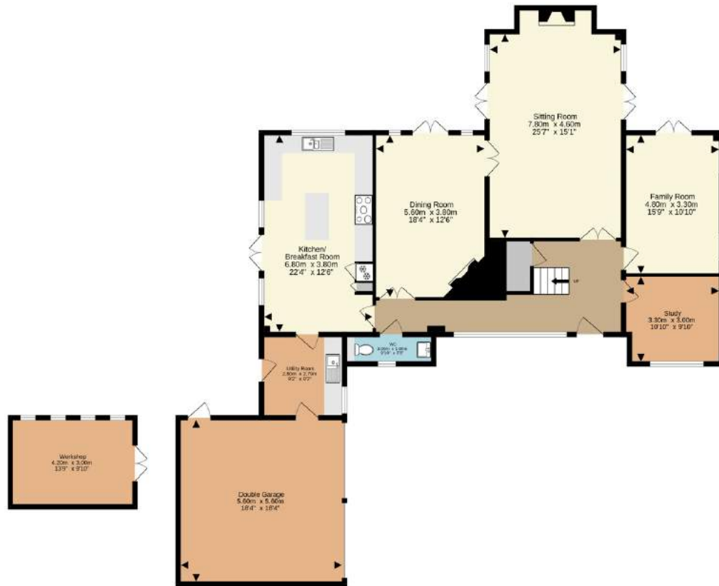
Ground Floor 177.7 sq.m. (1913 sq.ft.) approx.