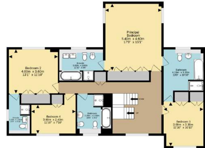
2nd Floor 91.3 sq.m. (982 sq.ft.) approx.